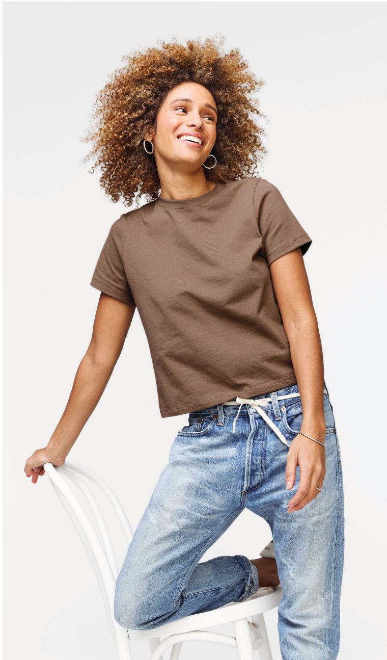
Left: BELLA+CANVAS 6110 in Vintage Brown. Right: American Apparel 1301 in Burgundy and BELLA+CANVAS 3001 in Dust.