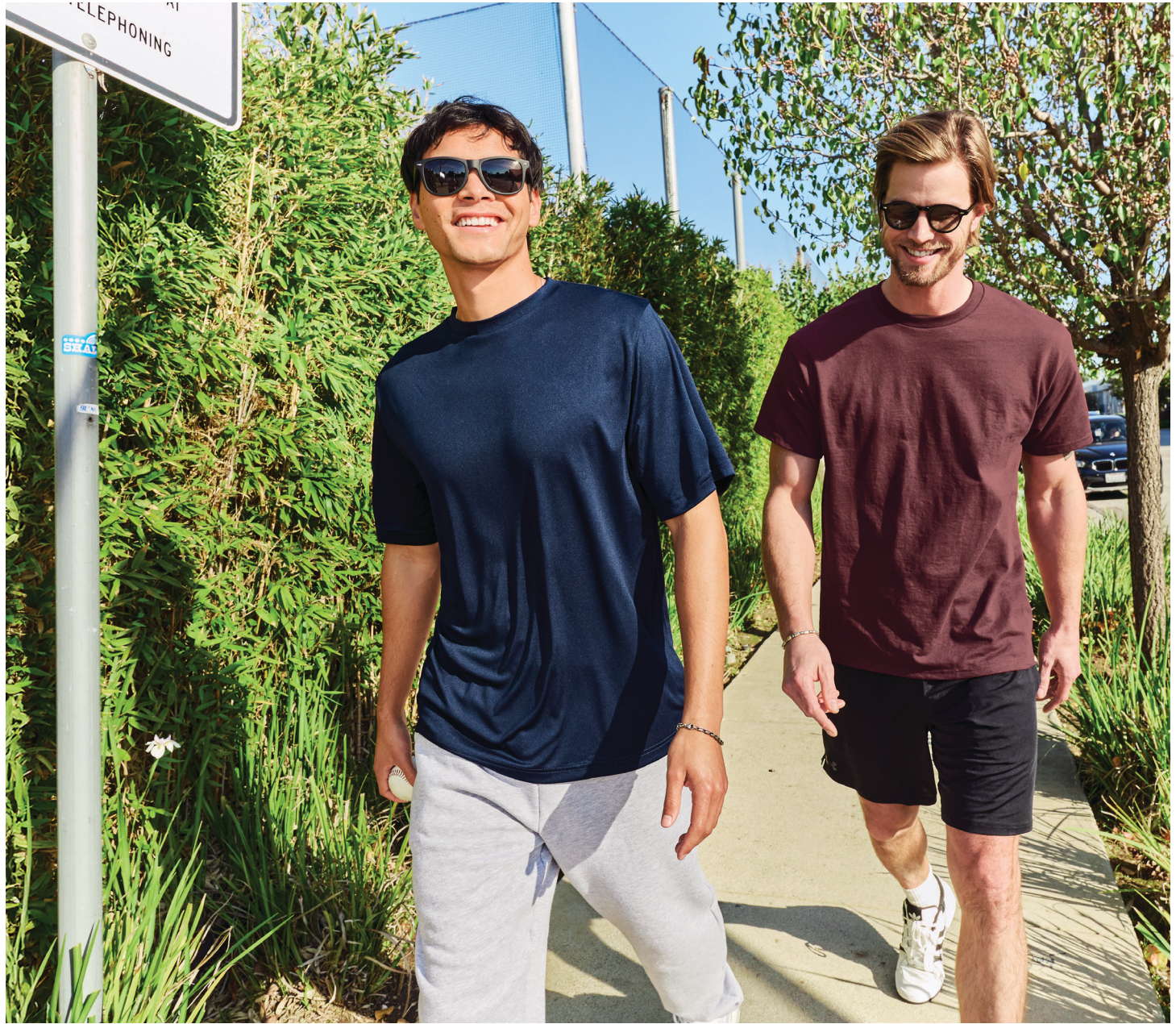
CORE365 CE10 in Classic Navy and Gildan 8000 in Dark Maroon.