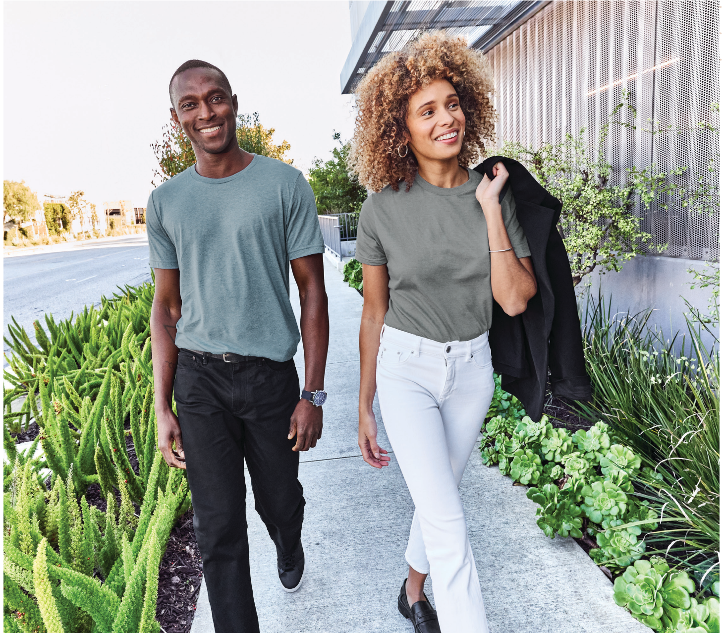
BELLA+CANVAS 3413 in Denim Tri-Blend and Gildan 64000CVC in Gunmetal.