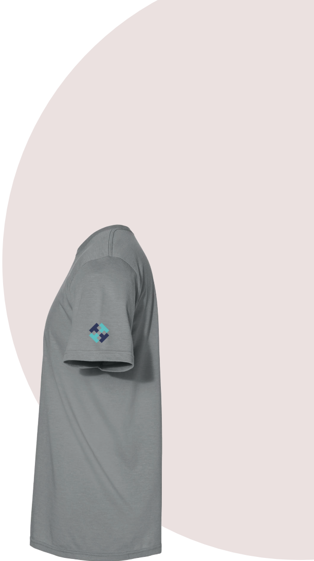
SLEEVES Width: 1 inch - 4 inches Height: 1 inch - 4 inches