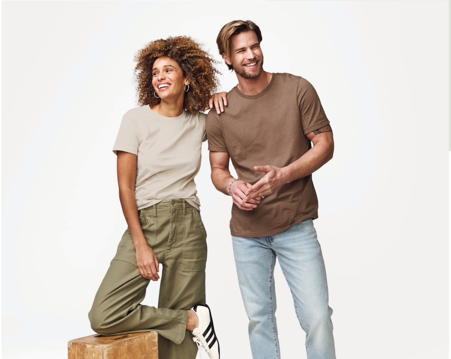
Next Level Apparel 3600 in Sand and BELLA+CANVAS 3001 in Vintage Brown.