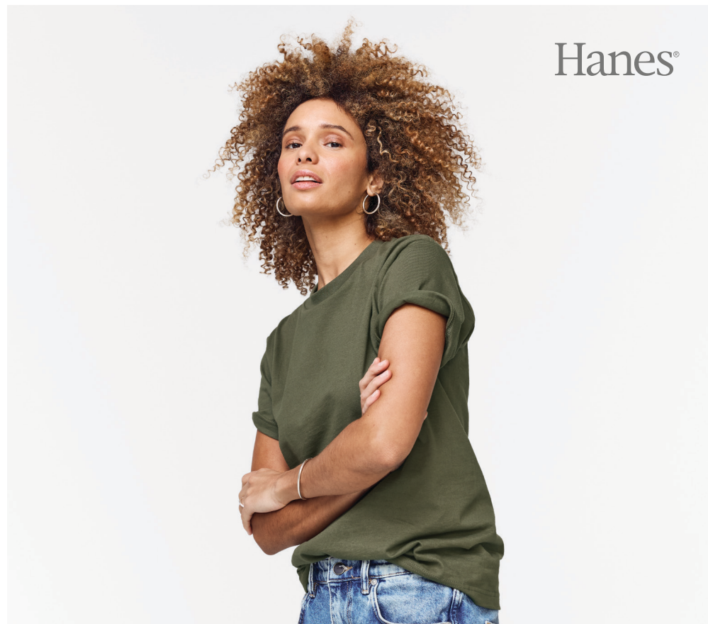
Hanes 5180 in Fatigue Green.