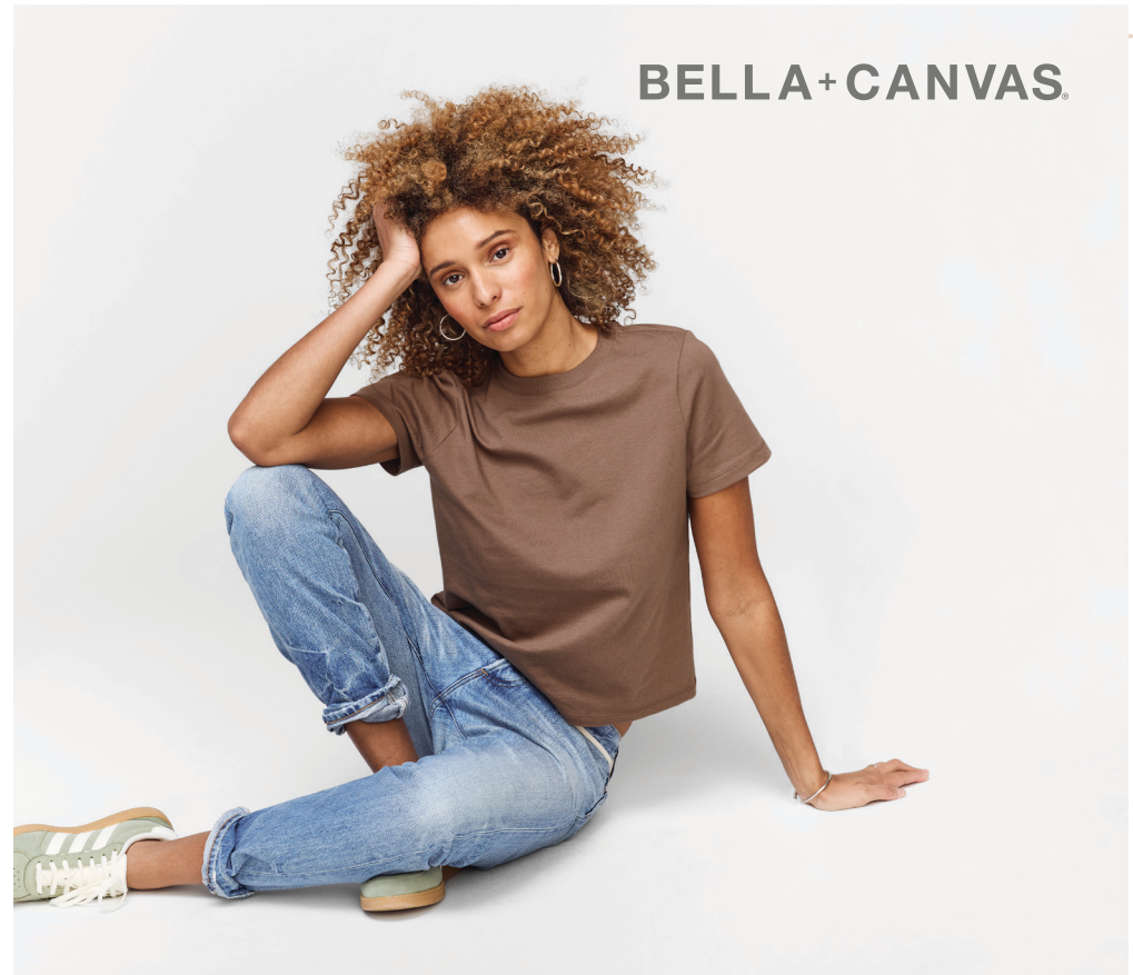
BELLA+CANVAS 6110 in Vintage Brown.