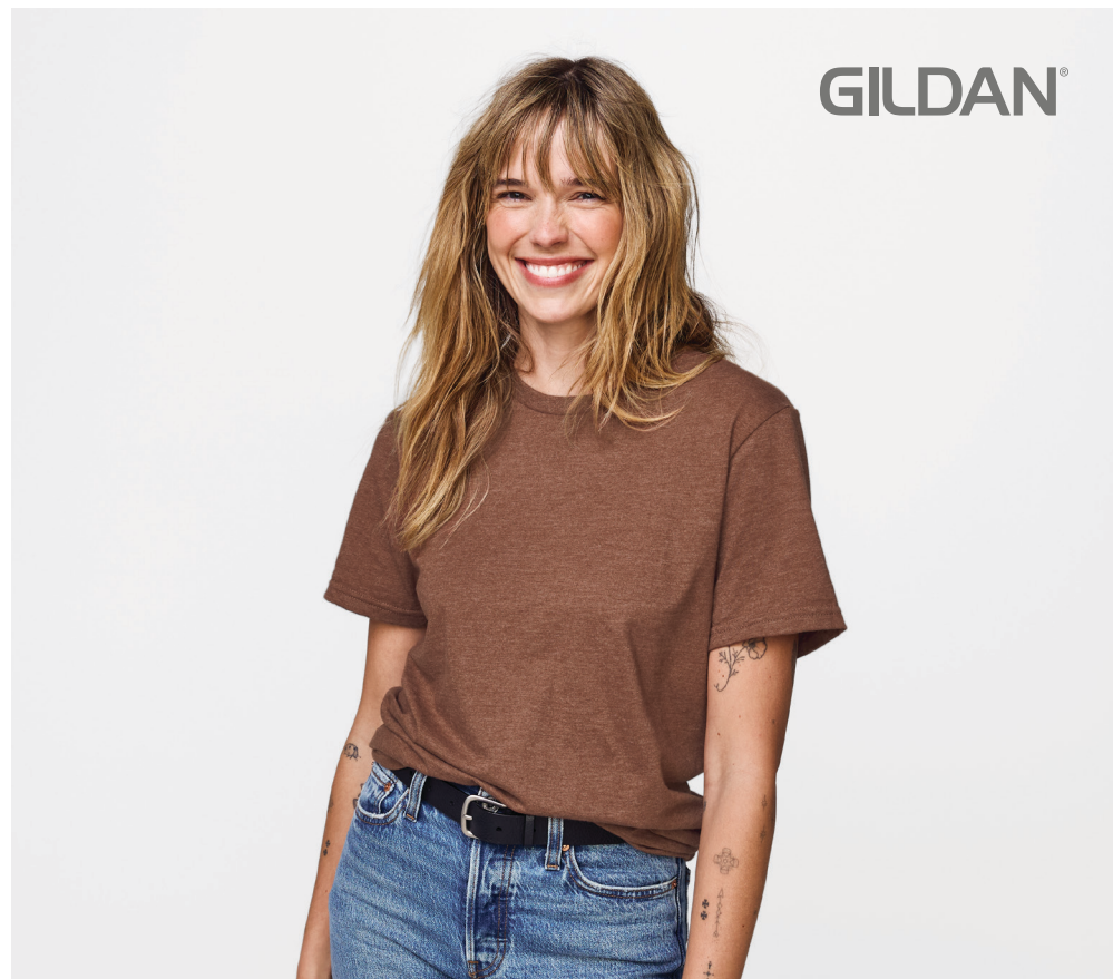
Gildan 64000CVC in Cocoa Mist.