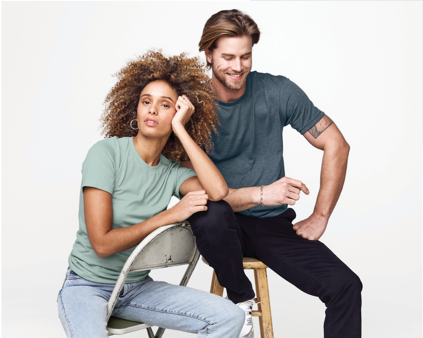
BELLA+CANVAS 3413 in Dusty Blue Tri-Blend and Next Level Apparel 6010 in Indigo.