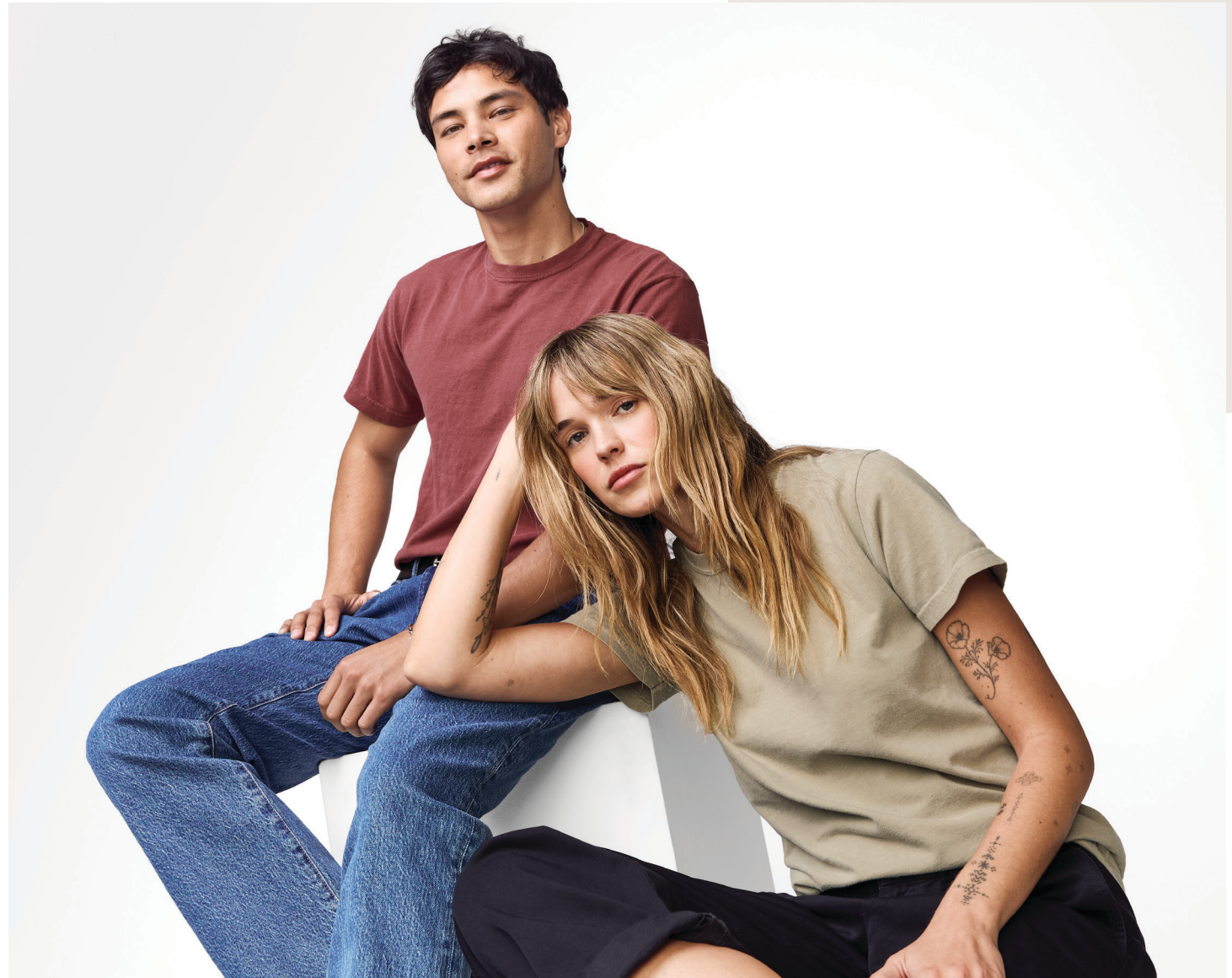
M&O 6500M in Brick and Comfort Colors 1717 in Khaki.