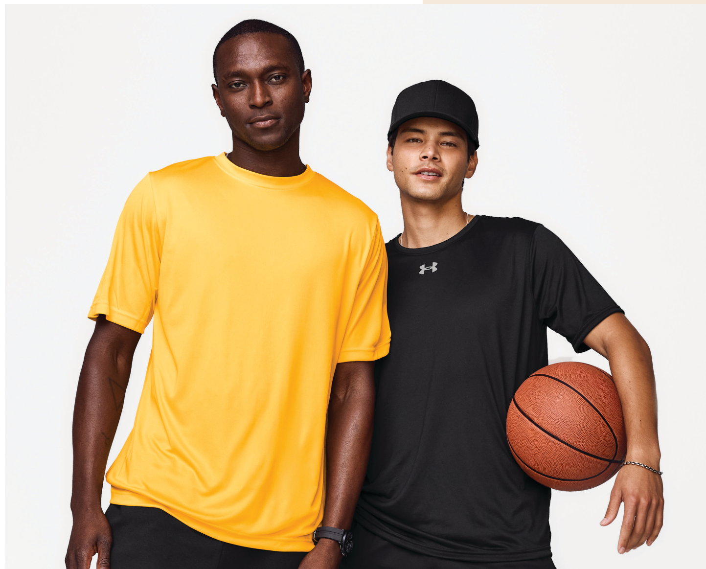
Team 365 TT11 in Sport Athletic Gold and Under Armour 1376842 in Black/White.