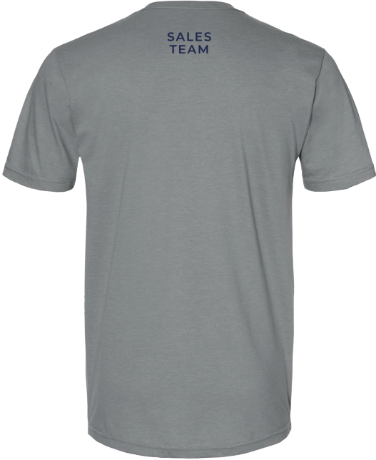
UPPER BACK Width: 3 inches - 14 inches Height: 1 inch - 6 inches