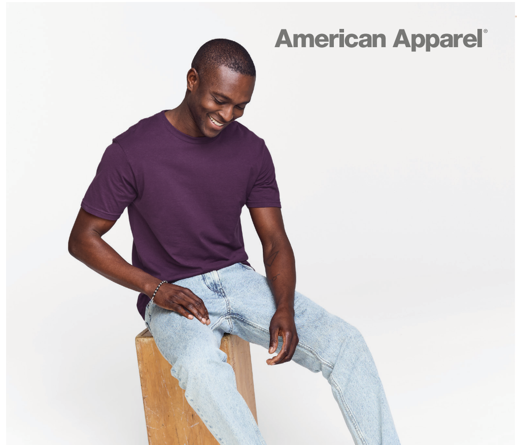
American Apparel 2001 in Eggplant.