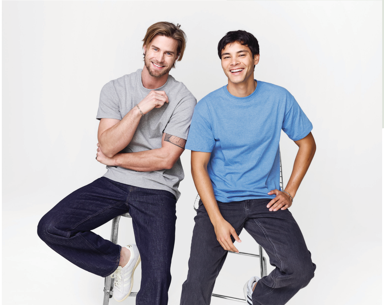
American Apparel 1301 in Heather Grey and M&O 4800 in Light Blue Heather.