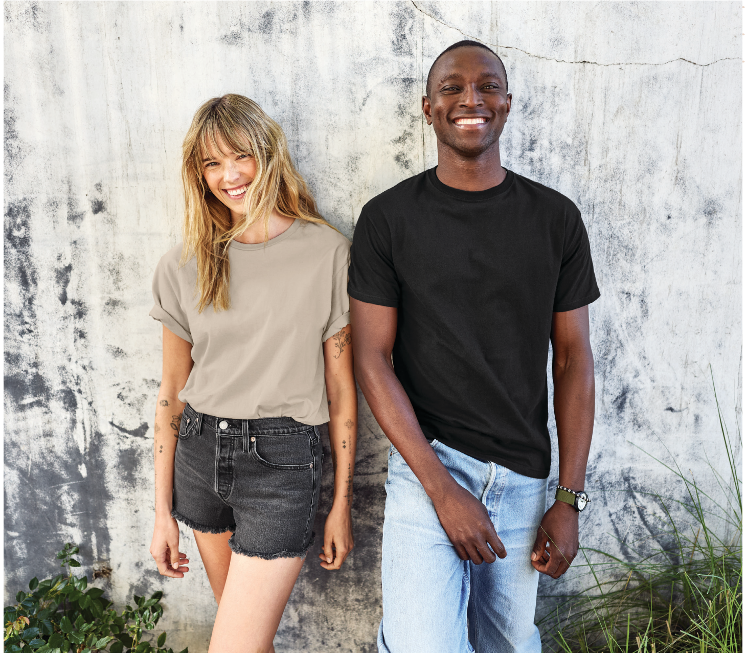
Gildan 64000 in Sand and M&O 4800 in Black.