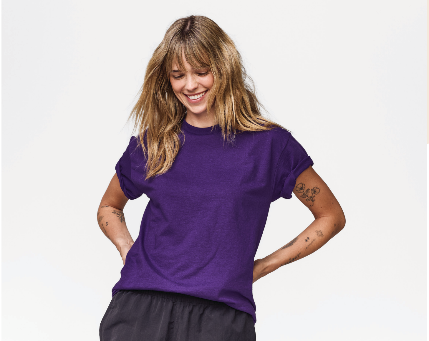
Gildan 8000 in Purple.