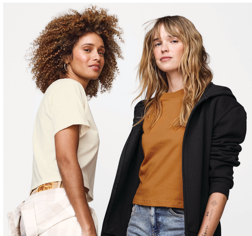
Left: Gildan 64000CVC in Cocoa Mist. Right: American Apparel 102 in Creme and BELLA+CANVAS 6110 in Toast.