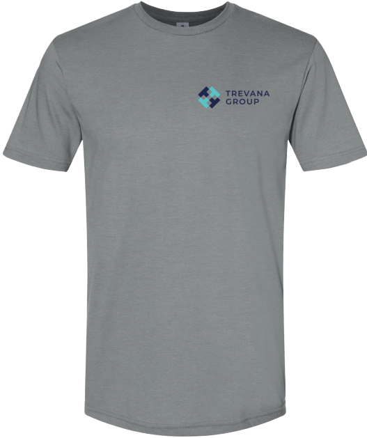
LEFT CHEST Width: 2.5 inches - 5 inches Height: 2.5 inches - 5 inches