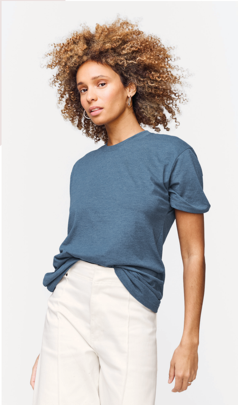
American Apparel TR401 in Tri-Dusk.