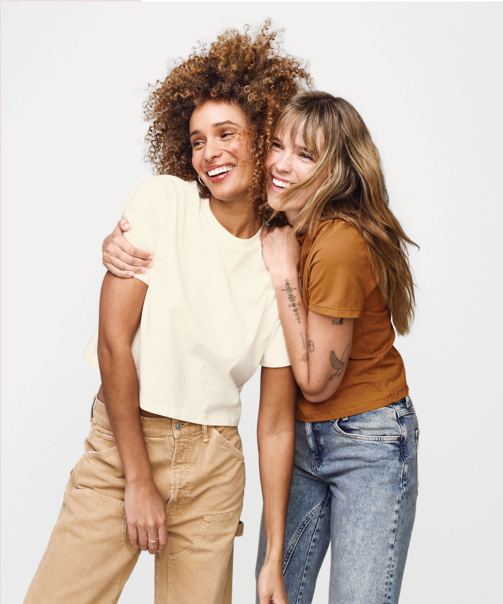
American Apparel 102 in Creme and BELLA+CANVAS 6110 in Toast.