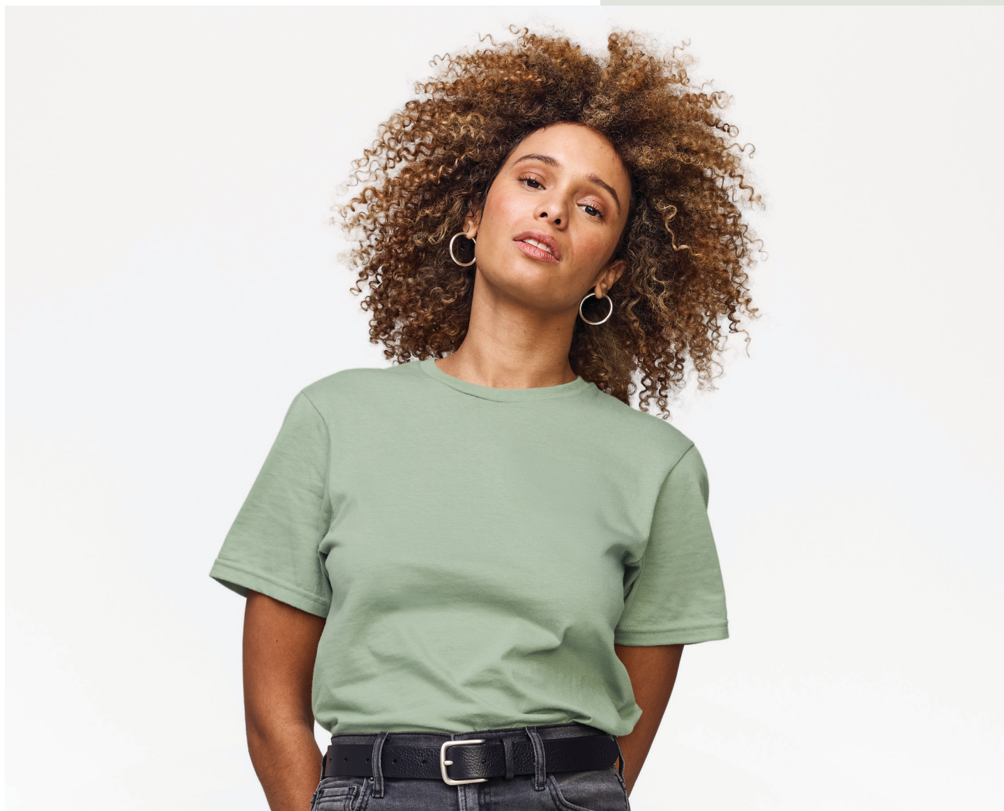
Gildan 64000 in Sage.