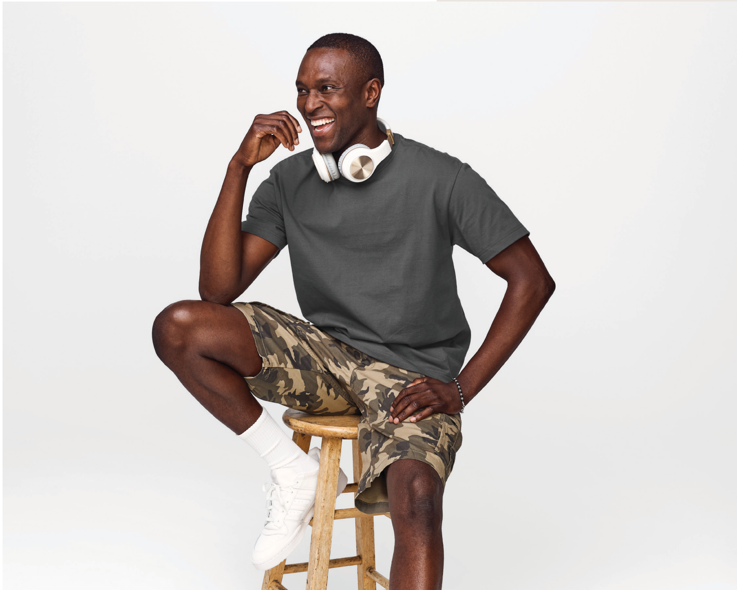
BELLA+CANVAS 4610 in Asphalt.