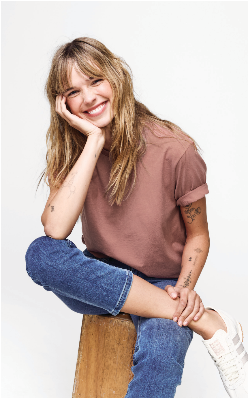
Tultex 602 in Mauve.